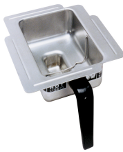
FUNNEL ASSY, SST-PP BLK HDL