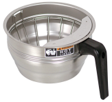
FUNNEL ASSY, SST-BLK HDL(7.12)