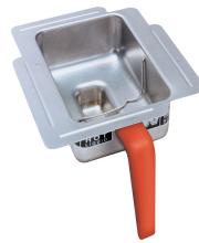
FUNNEL ASSY,SST-PP ORANGE HDL