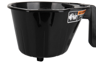
FUNNEL ASSY, SMART COFFEE BLK-CLEARED